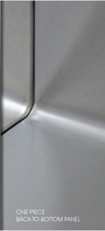
ONE PIECE BACK-TO-BOTTOM PANEL