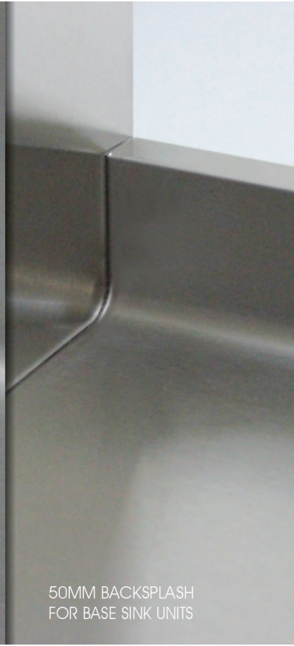
50MM BACKSPLASH FOR BASE SINK UNITS