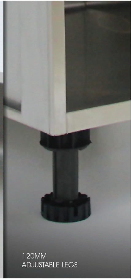
120MM ADJUSTABLE LEGS